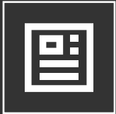
Custom login page