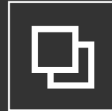
Logo deployed across platform