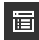
Efficient offline working