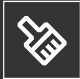
Different colour features