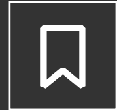
Personalised webpage headers